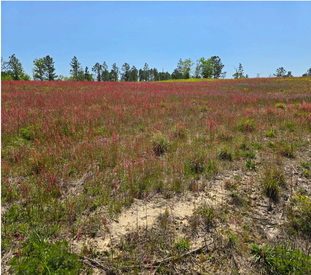
View looking up towards Clubhouse from 18 fairway-Clubhouse to #18 fairway(below)